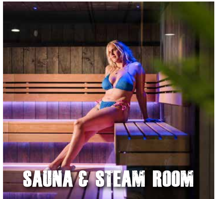
SAUNA & STEAM ROOM