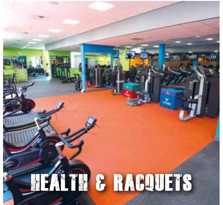
HEALTH & RACQUETS