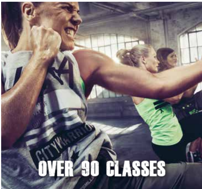
OVER 90 CLASSES