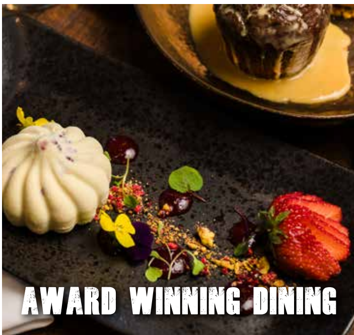
AWARD WINNING DINING