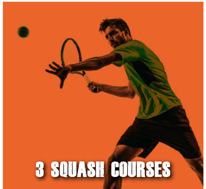
3 SQUASH COURSES