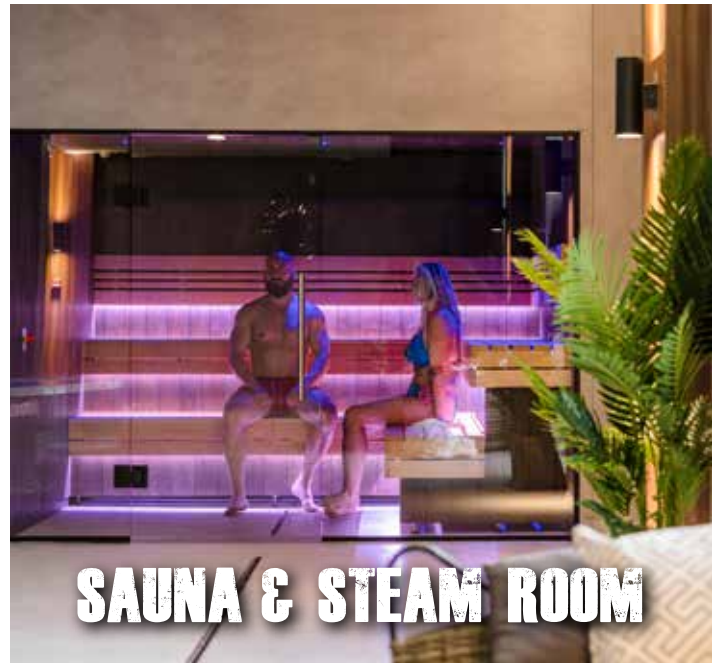
SAUNA & STEAM ROOM