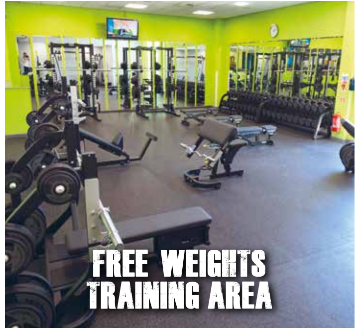
FREE WEIGHTS TRAINING AREA