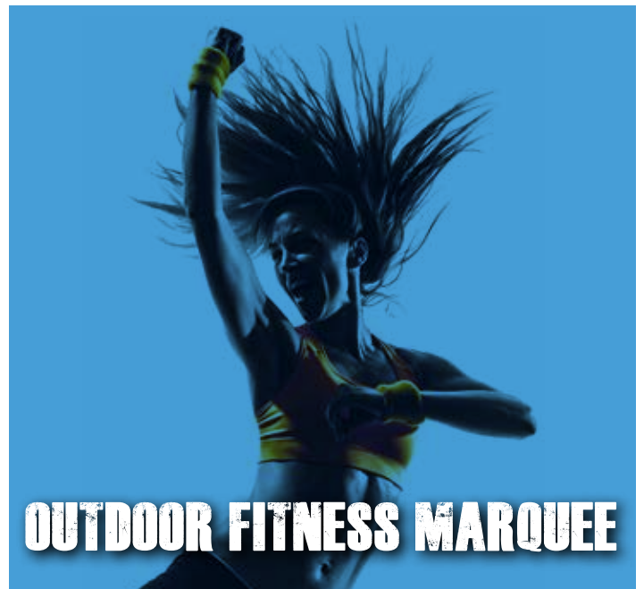
OUTDOOR FITNESS MARQUEE