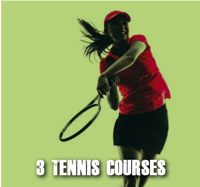
3 TENNIS COURSES