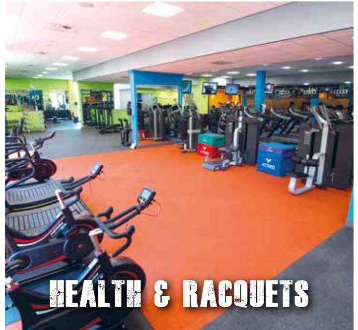
HEALTH & RACQUETS