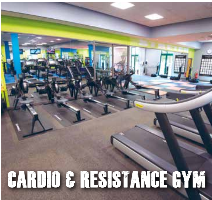
CARDIO & RESISTANCE GYM