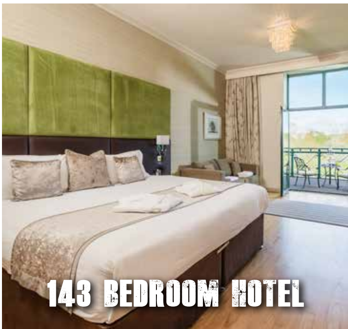
143 BEDROOM HOTEL