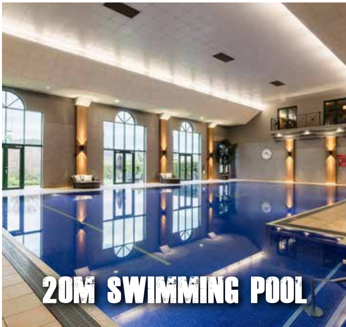
20M SWIMMING POOL