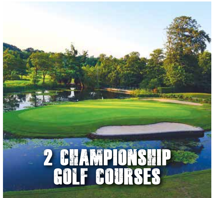
2 CHAMPIONSHIP GOLF COURSES