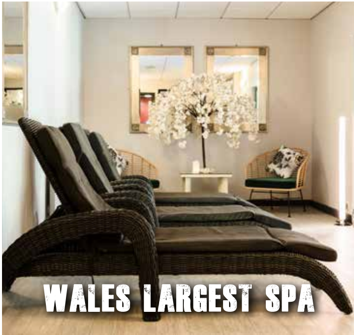
WALES LARGEST SPA